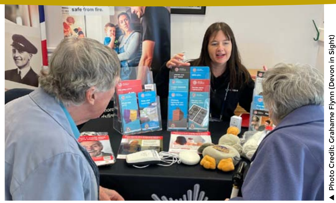
▲ The Fire Service at a Living Well with Sight Loss Event