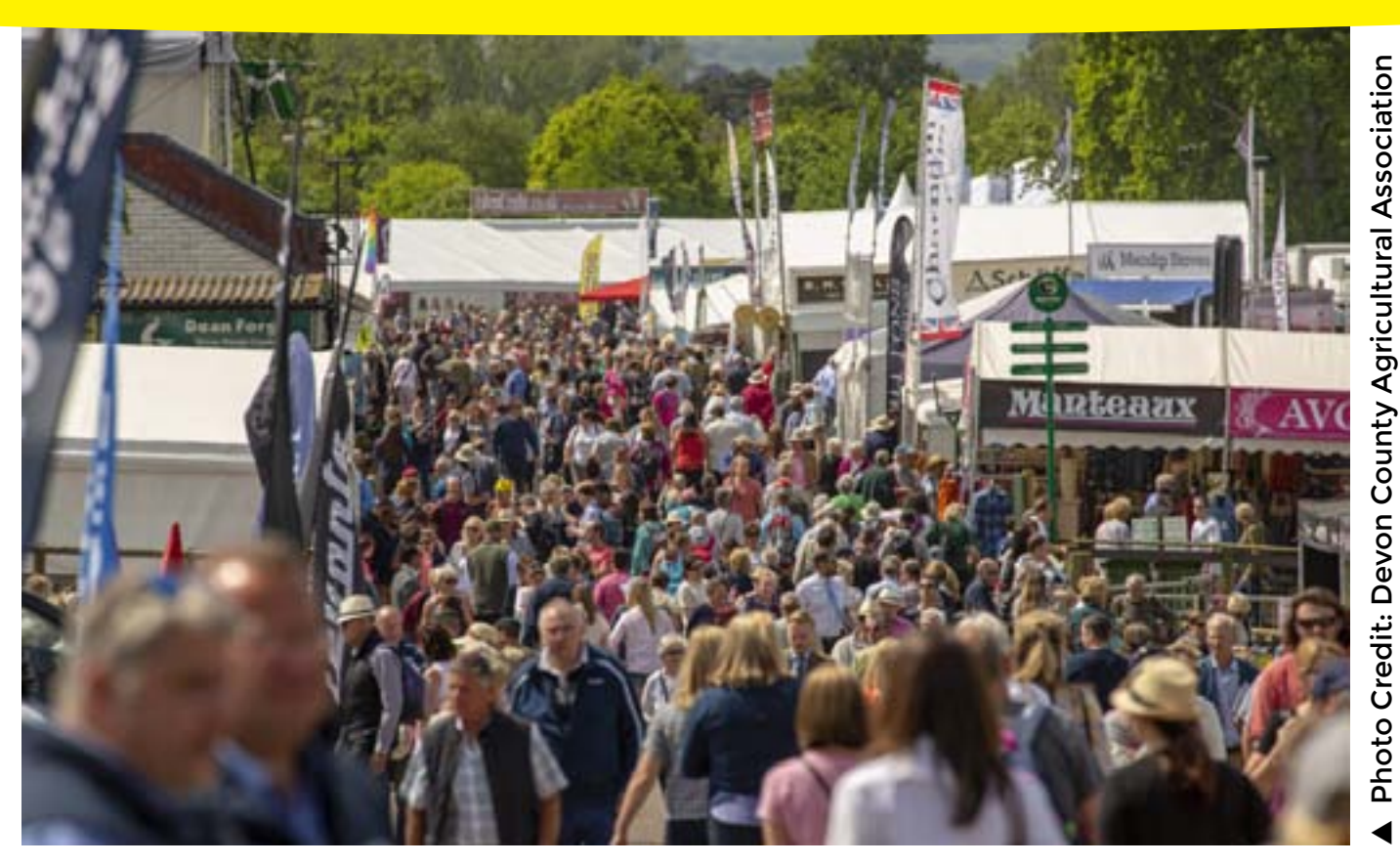
▲ Busy crowds at last year's Devon County Show

In 2023 the Devon County Show welcomed in excess of 96,000 attendees across its three show days – one of the highest attendance figures in the Devon County Agricultural Association's 151-year history.