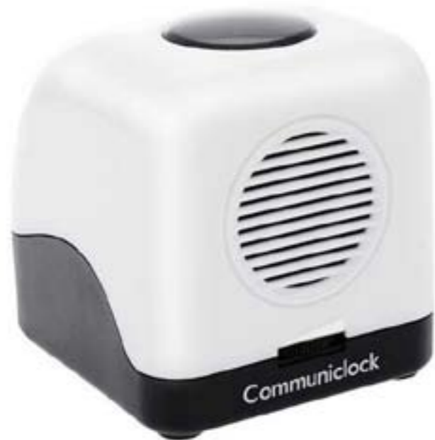
▲ A Talking Communiclock

At the height of the COVID-19 restrictions we started our Equipment Bursary Fund. This allows us to provide our clients with some popular independent living equipment for free.