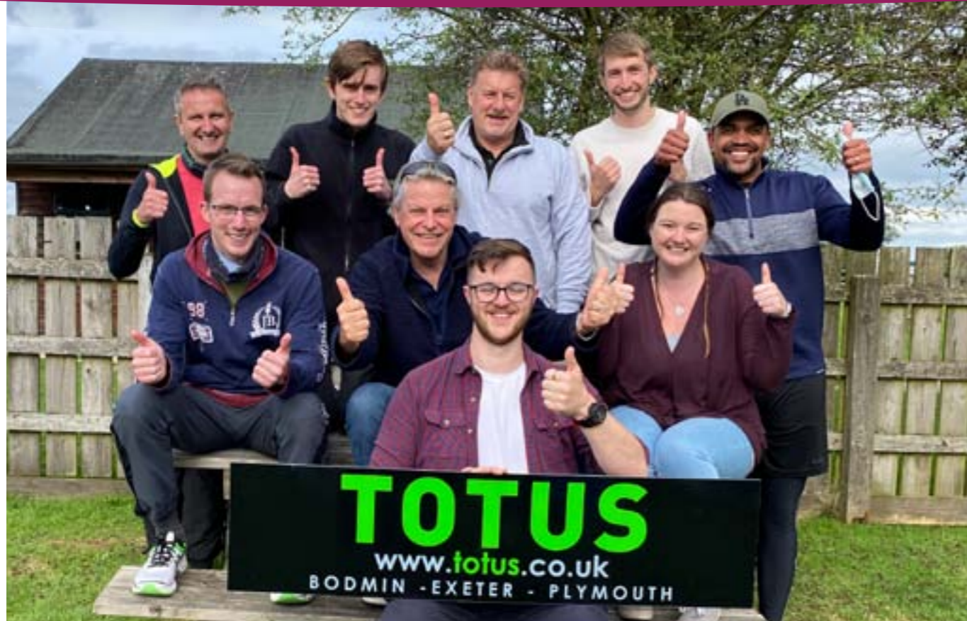
▲ Team TOTUS

There are many different volunteering opportunities available at Devon in Sight depending on the time you are able to give; whether you have an hour or so each week or can give much more.