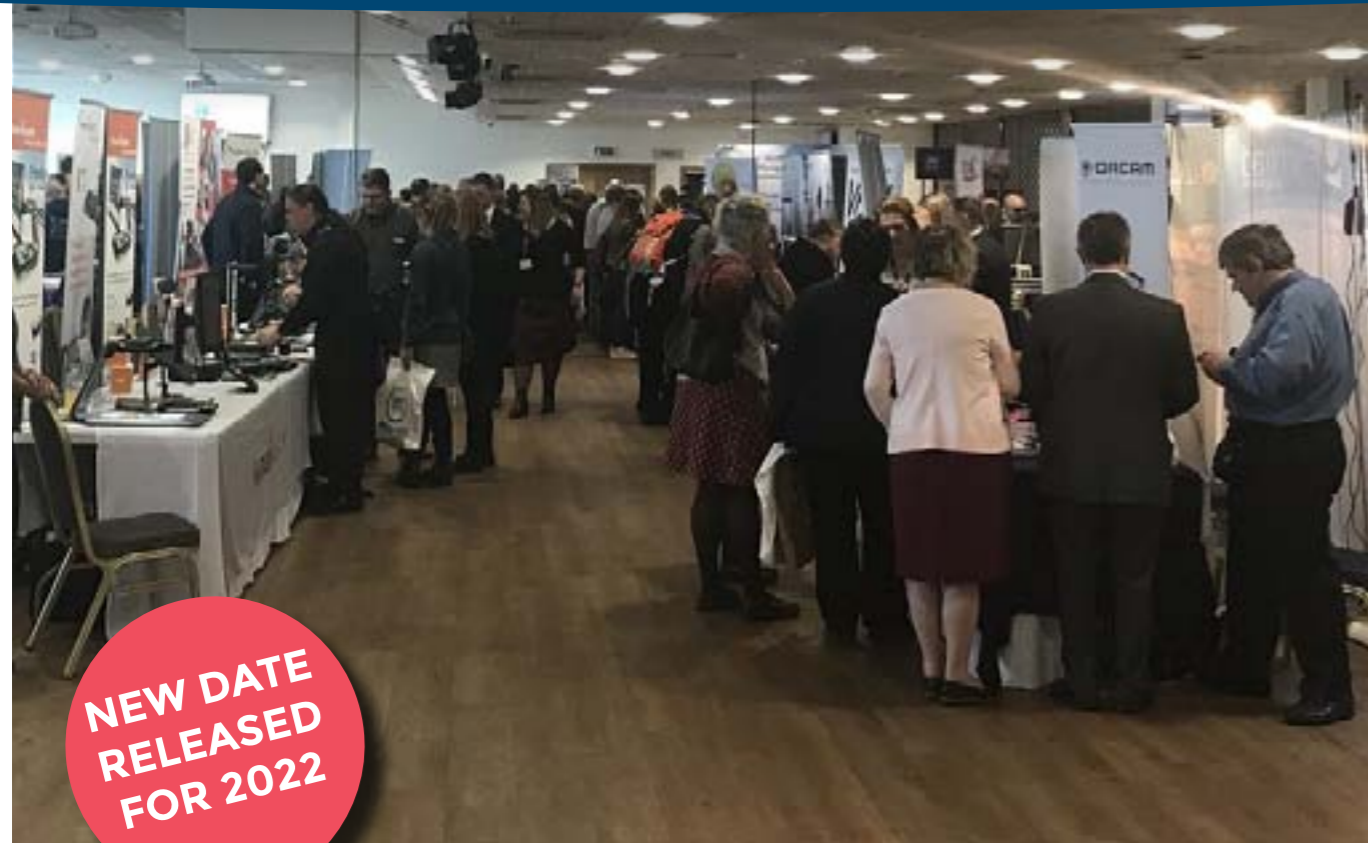
▲ Sight Village in 2018